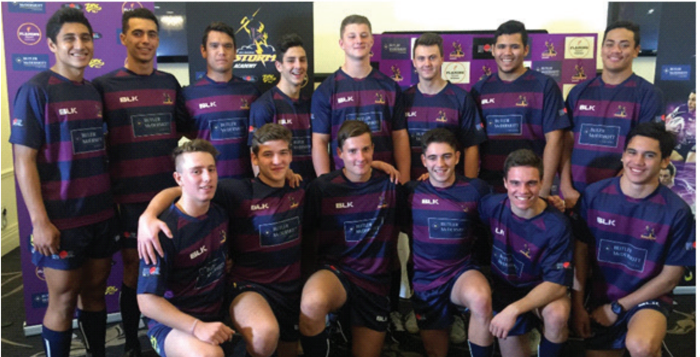
Easts Tigers players at the Eastern Storm Academy 2015 season launch